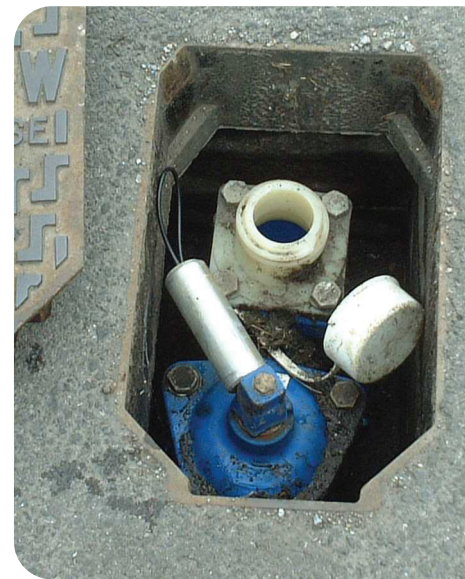
Leak localising logger for detecting areas of the network with leaks.

Leak location practices and techniques have advanced rapidly in the last few years, with the result that leakage awareness and detection times have been greatly reduced. It is vital that good quality repairs are carried out as quickly as possible in order to maximize the savings and also, of